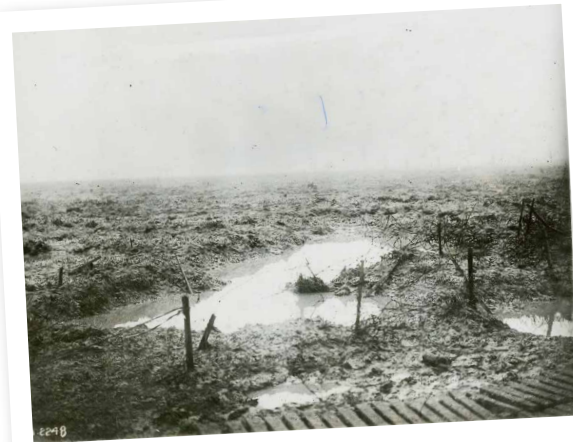
Terrain at Passchendaele, late 1917

To recreate the conditions the brave soldiers endured, visit a mud pit at your local Scout Camp, or find a safe place to build your own. In clothing that you don’t mind ruining, try to race across the pit, crawl across the pit and even hide in the pit! Remember to count your blessings when you enjoy a refreshing swim or a warm shower when you’re done.